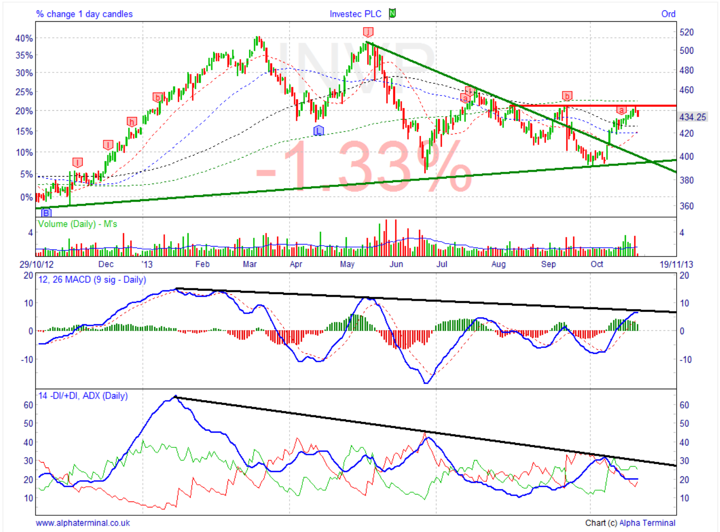
Graph: 1-year (daily) - ADX and Directional Indicators, MACD & Volume

Moving averages on price: Green: 200-period, Black: 100-period, Red: 50-period, Red: 20-period