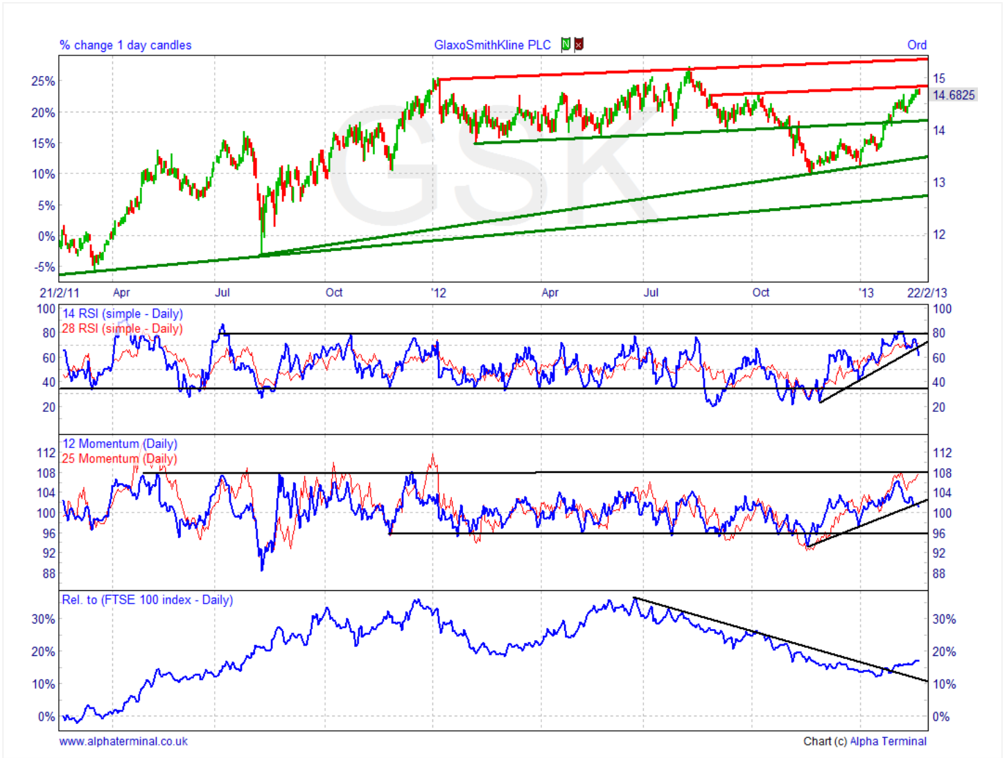
Graph: 2-year (daily) - RSI, Momentum and Performance relative to FTSE 100

Leveraged products involve a high level of risk and you can lose more than your original investment. They are not suitable for everyone so please ensure you understand the risks involved and if necessary please obtain investment advice from a financial adviser before investing. This report is not a personal recommendation and does not take into account your personal circumstances or appetite for risk.