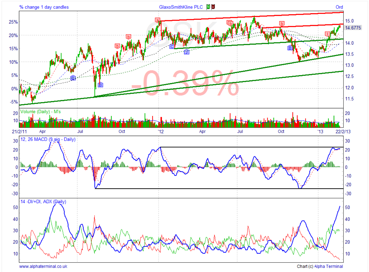
Graph: 2-year (daily) - ADX and Directional Indicators, MACD & Volume

Moving averages on price: Green: 200-period, Black: 100-period, Red: 50-period, Red: 20-period