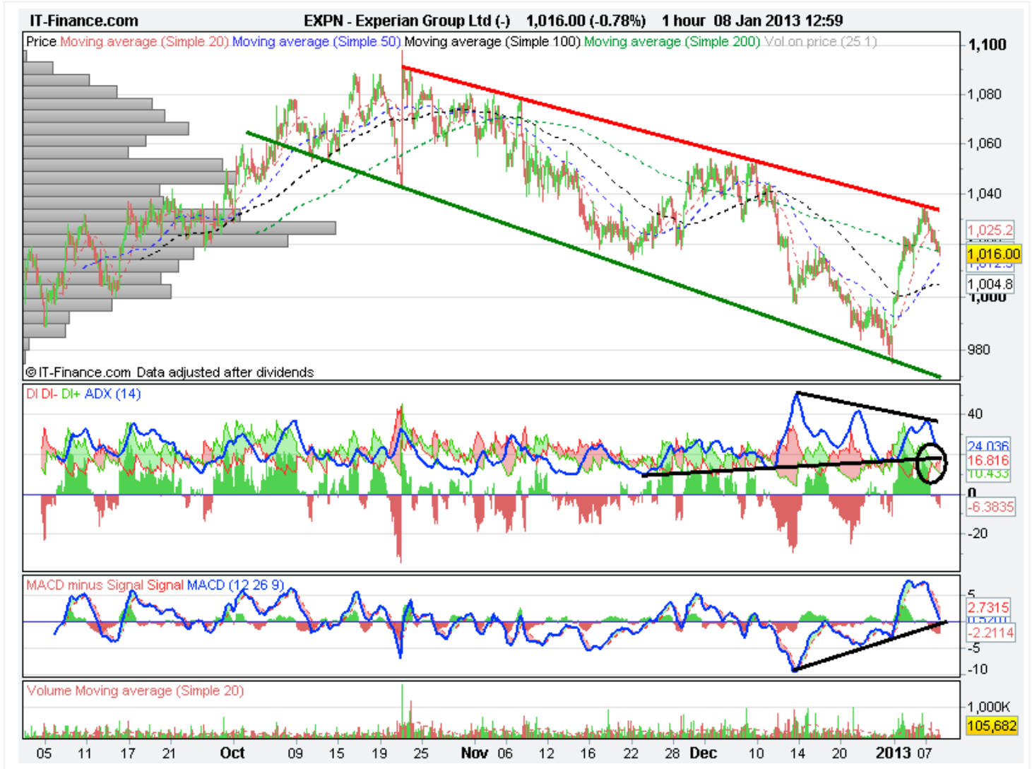
Graph: 3-month (hourly) - ADX and Directional Indicators, MACD & Volume

Moving averages on price: Green: 200-period, Black: 100-period, Red: 50-period, Red: 20-period