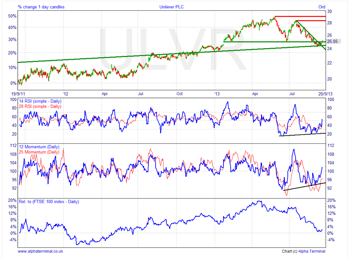
Graph: 2-year (daily) - RSI, Momentum and Performance relative to FTSE 100

Leveraged products involve a high level of risk and you can lose more than your original investment. They are not suitable for everyone so please ensure you understand the risks involved and if necessary please obtain investment advice from a financial adviser before investing. This report is not a personal recommendation and does not take into account your personal circumstances or appetite for risk.