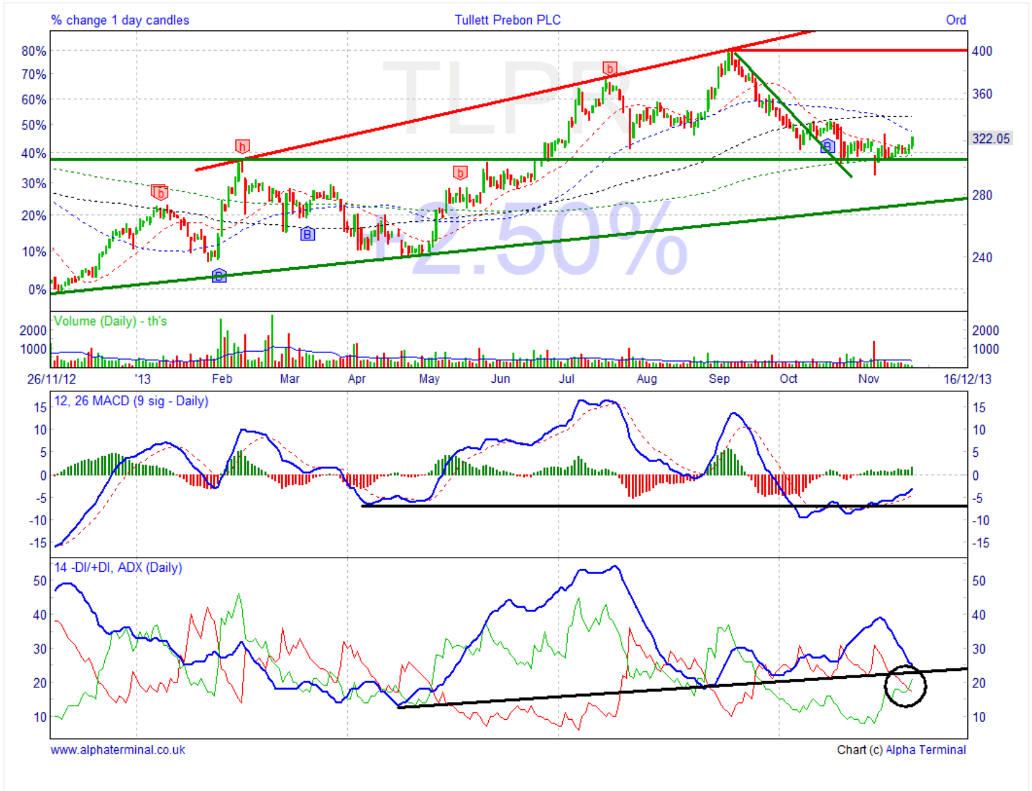
Graph: 1-year (daily) - ADX and Directional Indicators, MACD & Volume

Need help understanding this page? Click