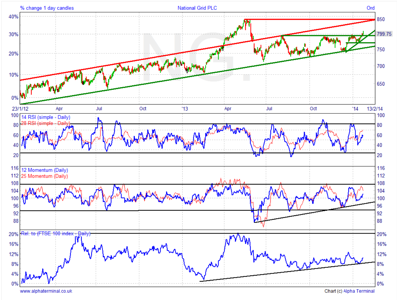
Graph: 1.5-year (daily) - RSI, Momentum and Performance relative to FTSE 100

Leveraged products involve a high level of risk and you can lose more than your original investment. They are not suitable for everyone so please ensure you understand the risks involved and if necessary please obtain investment advice from a financial adviser before investing. This report is not a personal recommendation and does not take into account your personal circumstances or appetite for risk.