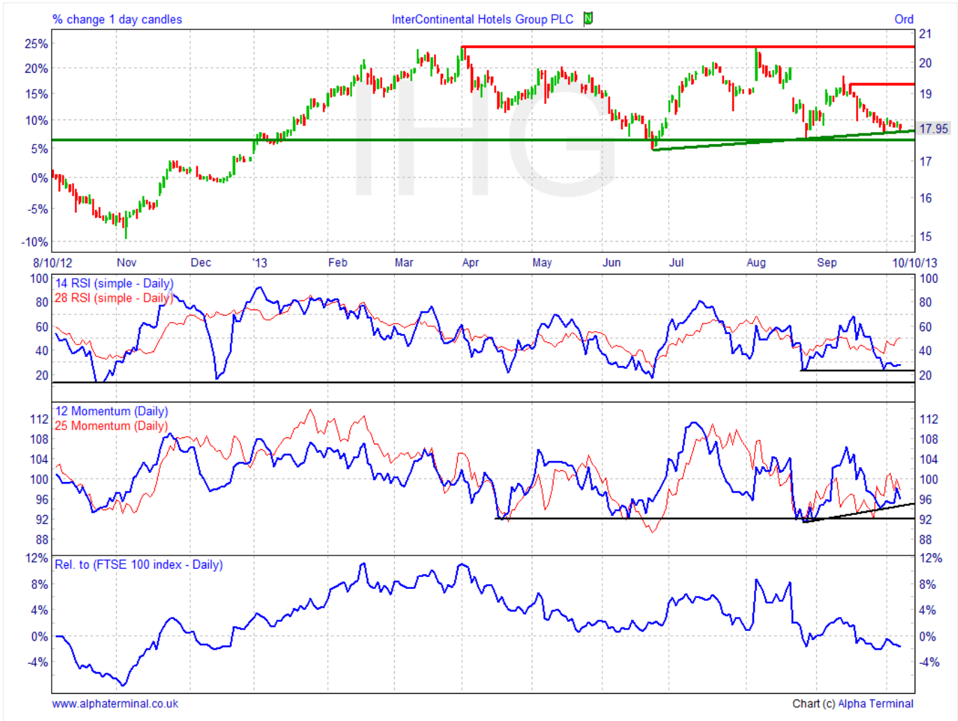
Graph: 1-year (daily) - RSI, Momentum and Performance relative to FTSE 100

Leveraged products involve a high level of risk and you can lose more than your original investment. They are not suitable for everyone so please ensure you understand the risks involved and if necessary please obtain investment advice from a financial adviser before investing. This report is not a personal recommendation and does not take into account your personal circumstances or appetite for risk.