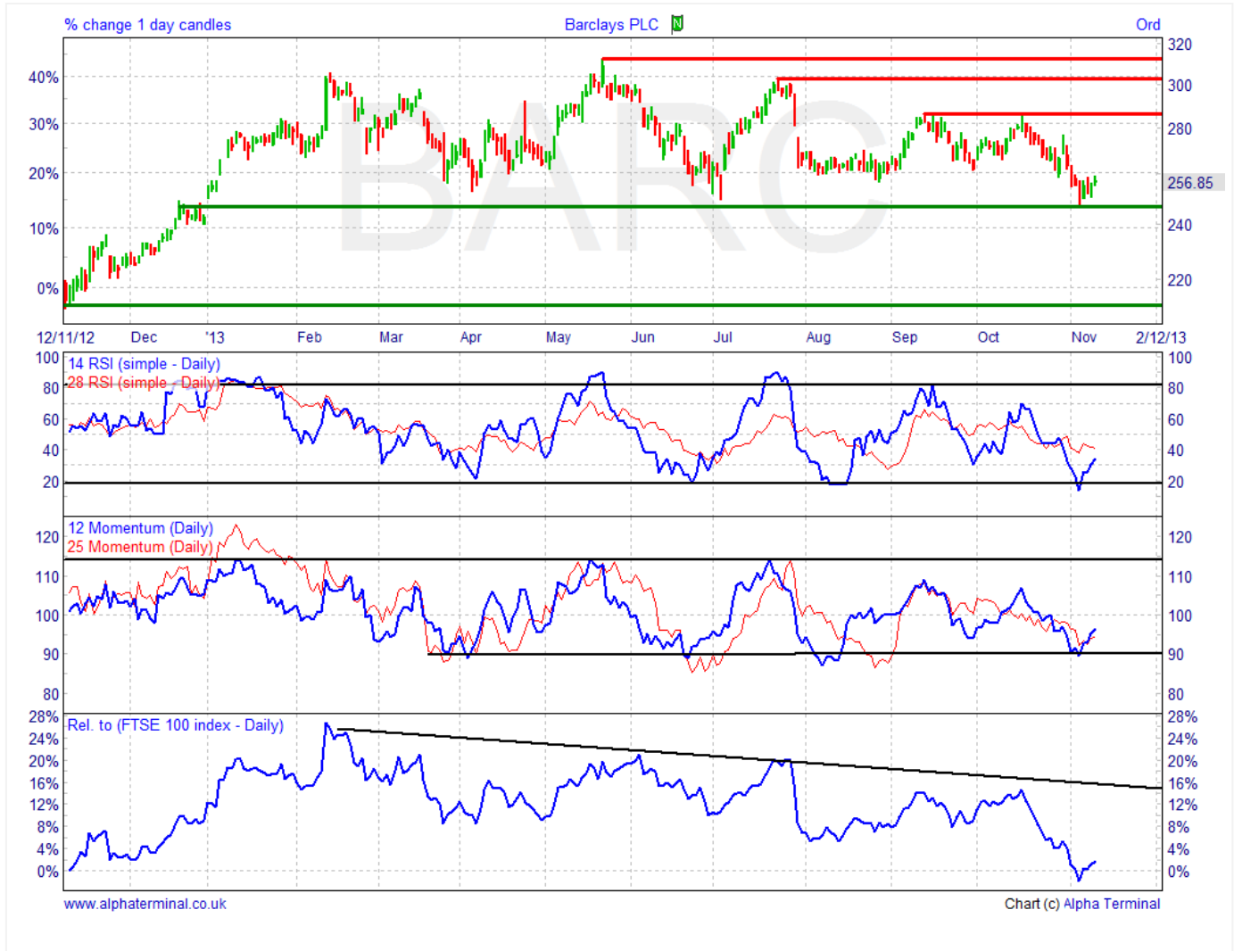
Graph: 1-year (daily) - RSI, Momentum and Performance relative to FTSE 100

Leveraged products involve a high level of risk and you can lose more than your original investment. They are not suitable for everyone so please ensure you understand the risks involved and if necessary please obtain investment advice from a financial adviser before investing. This report is not a personal recommendation and does not take into account your personal circumstances or appetite for risk.