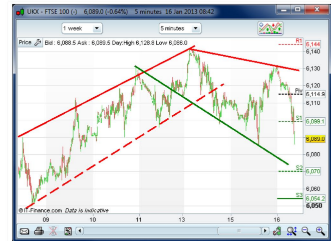
Graph: FTSE 100 (Futures), 1-week, 5 min intervals

Need help with Technical Analysis? Click